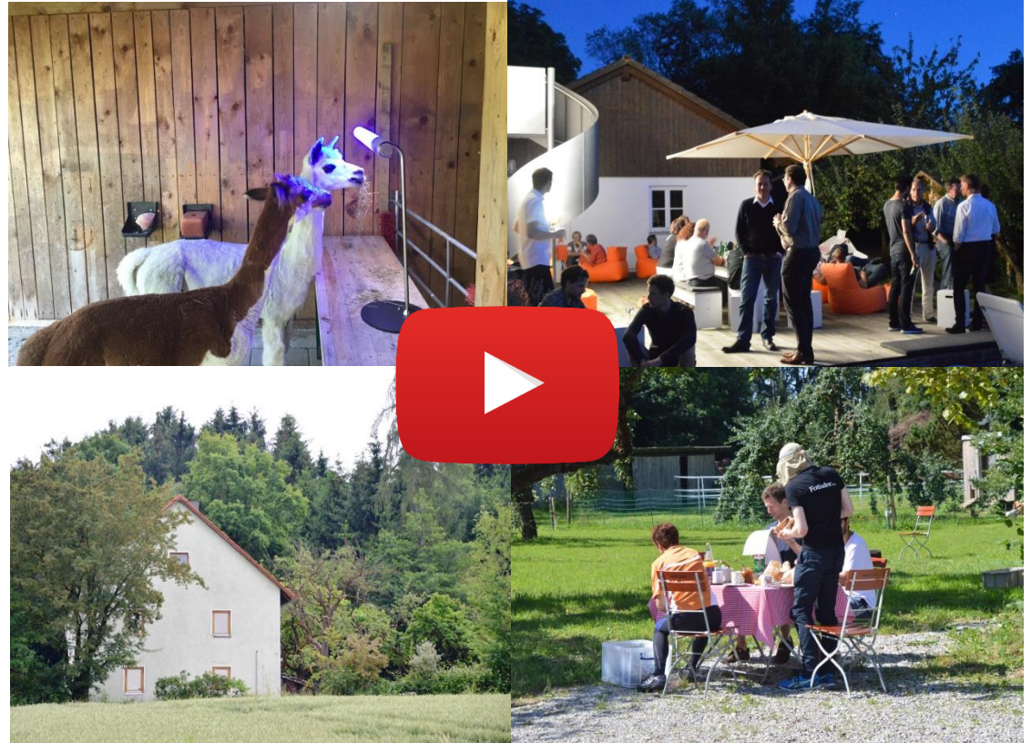
Upper left photo: HEAVN

Startups can prototype and live test their products and services, together with municipalities and corporations, that decide and act in “startup speed”. According to their needs and stage of development, we offer support with media coverage, contacts, test users, pitching opportunities etc.